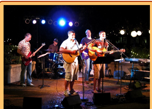
Worship at an acts64 Tuesday night session

night at 8 p.m., students from around the area are gathering at Crave for worship, prayer, discussion—and free coffee. We also offer opportunities for students to participate in servant events, connecting events, mission trips, and leader development.”