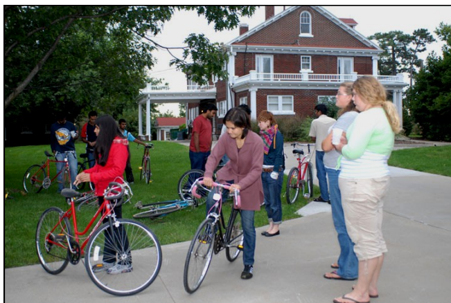
Bicycle distribution at Northwest Missouri State's Lutheran Campus Center.