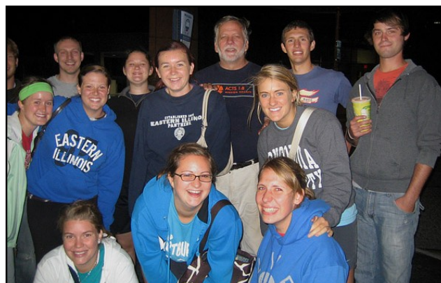
SMC group, St. Louis, 2010

LCMS Campus Ministry and the Acts 1:8 Mission Society will host SMC 2011 October 7-9 at The Rock in St. Louis. Visit our SMC page for detailed information. Come explore how to lead the church's mission for the 21st century. (Cont. page 3)