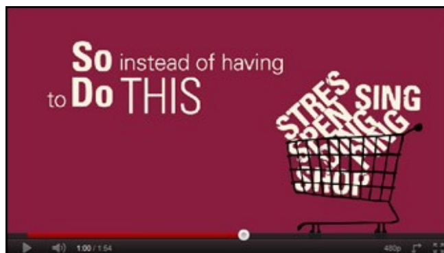
Screen capture from Advent Conspiracy's 2009 promo video

Well, it's all very mysterious, but according to the blog on its website, the movie Blue Like Jazz —based on the book by Donald Miller—will be released this fall ( bluelikejazzthemovie.com/movie-info ). We'd like to publish one or more reviews of the film. Interested? Email us at campusmission@yahoo.com .