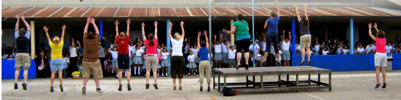
"Raucous"? Students lead a song for kids at a VBS session.