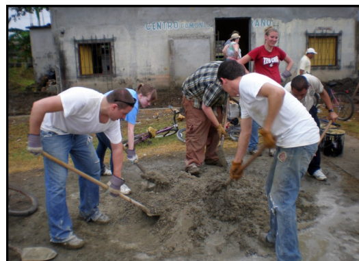
The construction team works to build a front wall for the Lutheran Community Center.

Our construction team worked nonstop every day, digging two huge ditches on either side of the sidewalk leading up to the community center, and then adding forms, concrete, boulders, more concrete, blocks and mortar to build a front wall. No easy task at sea level. It was grueling labor, but hugely rewarding.